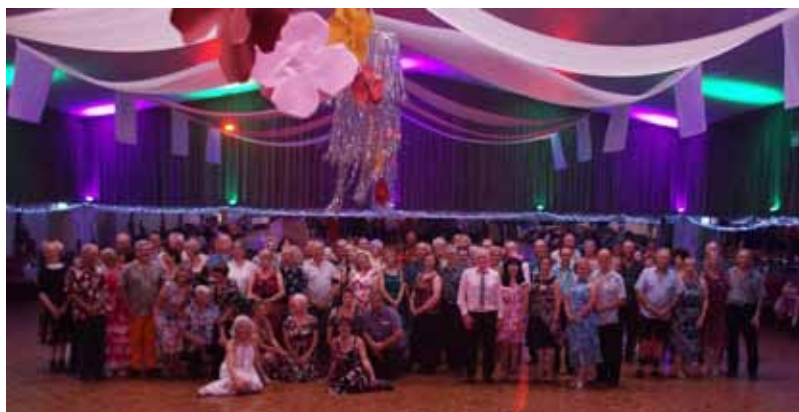
Here's to 2022!

Subject to the various Covid 19 regulations, the Geelong Ballroom welcomes dancers from everywhere to our Hamlyn Heights (Geelong) venue, for dances every Saturday night from 7:30 pm.